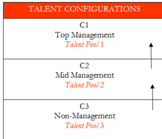
Figure 3. Talent as a configuration

Proposition 2.3. Talent pool 3 is comprised of employees that do not hold management positions and develop their talent in a period of time exceeding 5 years.